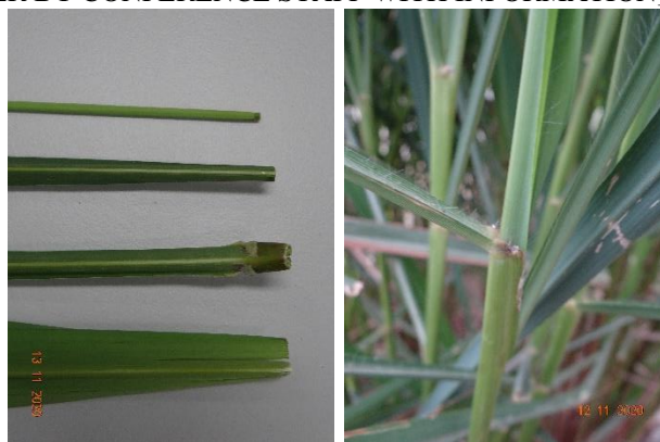
Figure 5. Leaf/plant inserts

The protected growing environment resulted in a vegetative mass of edible stems of 45% of the total plant mass, which is quite high for the potential of the plant.