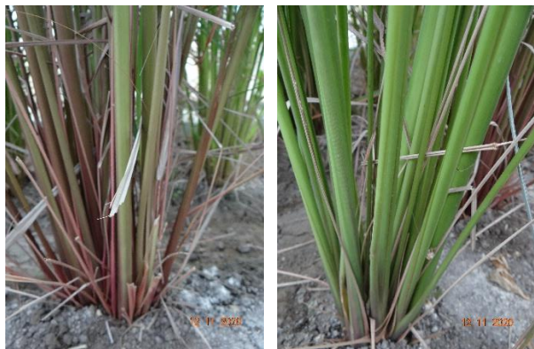
Figure 3. G1 (left) and G2 (right)