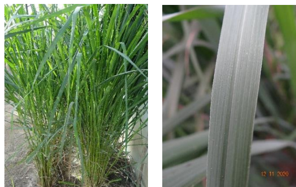
Figure 4. Plant and leaf details

Statistical calculations were performed using SPSS software, Pearson correlation coefficients were determined for the experimental variants, V1 S and V1 C as well as variance analysis by ANOVA test followed by DUNCAN test with 95% confidence interval and p-value < 0.05%.